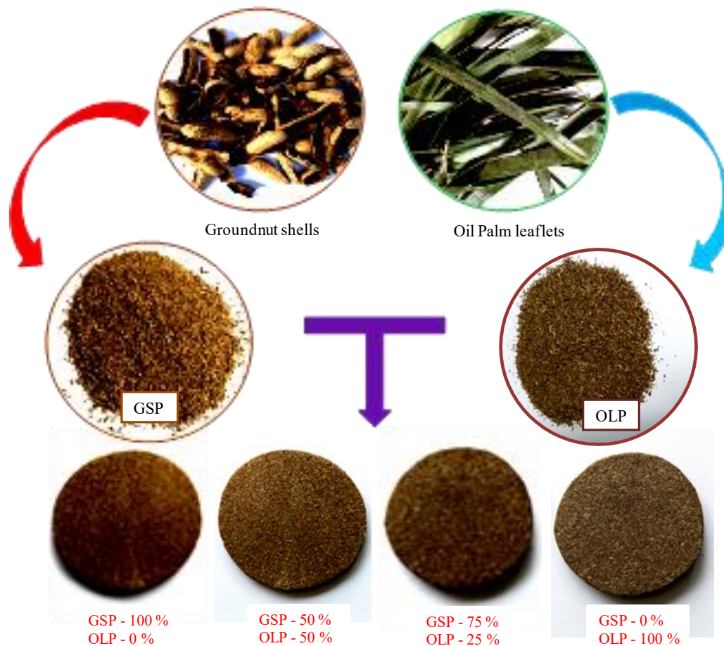
Figure 1. Samples preparation processes

GSP = Groundnut shell particles; OLP = Oil palm leaflet particles