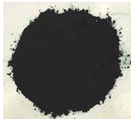
Fig. 2: Pyrolysis char from waste tyres

So many reviewed work have been focusing on pyrolysis oil been one of the product obtained during the process, but in this paper will focus on pyrolysis char as one of the important product obtained during pyrolysis so as to highlight its characteristics, application and further possible modification of the char.