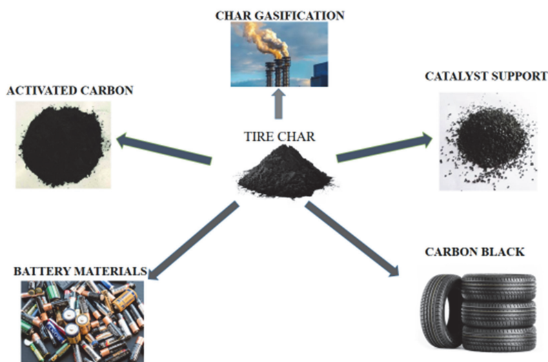
Fig. 4: The main high added value application of tyre char

Small pore widths and developed pores are features of tyre char. It cannot, however, match the application requirements of commercial carbon black due to its low specific surface area. Its economic worth is therefore minimal [23,24,26]. As a result, efforts are concentrated on finding efficient ways to raise tyre char's added value. Tyre char now has a wide range of applications; Fig. 4 illustrates these potential uses. The primary uses of activated carbon are as adsorbents made from modified tyre char [28], as well as asphalt additives, battery materials, commercial carbon black, rubber reinforcing materials, and catalyst support materials. Additional applications include gasification of fuel gas, adsorbent (activated carbon) as a catalyst and supporting material, reinforcement of tyre rubber as a material for batteries and capacitors, and materials for construction [19].