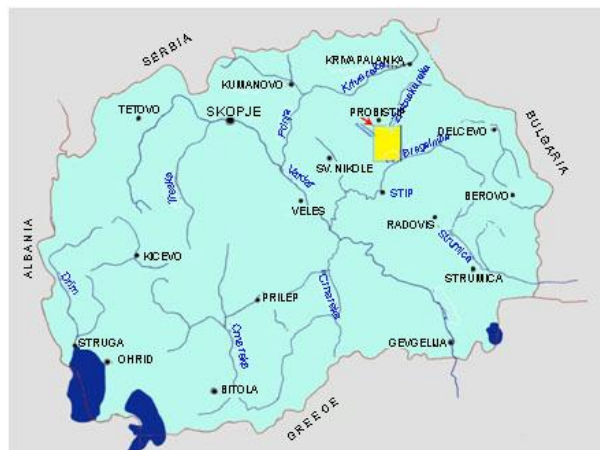
Figure 1. Map of Republic of Macedonia with the appointed position of the researching area

The area that was the subject of research comprises sediments from the immediate surroundings of the river Shtalkovska, Koritnica, river Kiselicka and River Zletovska to its estuary in the river Bregalnica (Figure 1). The field marked with a rectangle representing the area of the sediment samples.